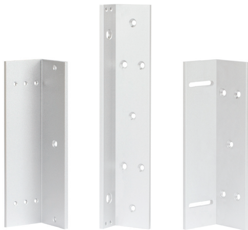
L and Z Brackets