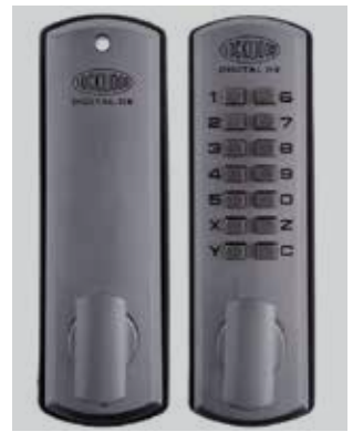
↑ Digital locks are easily programmable and full instructions are included.