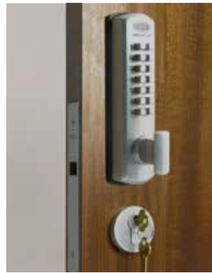
↑ CL100 DigiLock with key locking fitted to a timber veneer door.