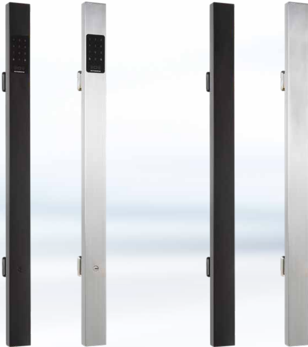
Entrance Pull Handles